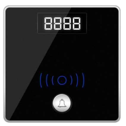
Door Bell with Access & Room Number

Built in Dual Power Supply (12VDC out + 24VDC out) Built in 2 Relays (32A and 5A) Built in Logic (Energy Smart) Door Reed Switch (Magnetic Contact) Input Ready Balcony Reed Switch (Magnetic Contact) Input Ready Room Occupancy Multi PIR Input Ready (NO/NC) Occupancy Flag Built In Logic Door Alert Watch Dog Smart-BUS Ready 80-220VAC Input and Control Cascadable and Networkable Comes Free with Device Monitoring and management Watch Dog Door Access with Door Bell and Logging