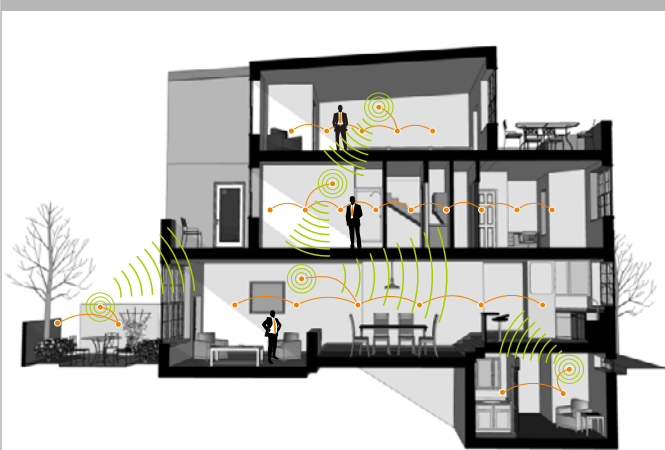
S-Bus Wired Network, with S-Wave Wireless Links