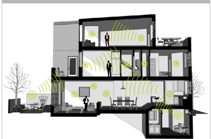
S-Wave Pure Wireless Network