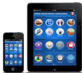
IPHONE & IPAD

Note: Maximum 50,000 of 4-Zone Modules can be Connected to give addressable 200,000 Zones Note: Maximum of 5000 9in1 and 6in1 or 5in1 can be connected to give 15000 Additional addressable Zones. Maximum of additional 5000 Simple BUS enabled PIR can Be added. Note: Maximum addressable Zones collectively should Not Exceed 250,000 Addressable Zones. SMS Modules Can Be added, RS-232, 485, and NO/NC relays can be added selectively.