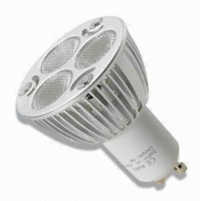
Dimmable LED spot

This requires special drivers or custom trailing edge Dimmers.