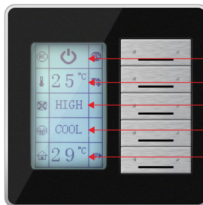
7 AC Pages: 1 Master+6 Slave