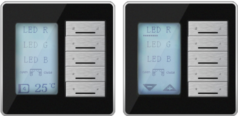
LED Lighting Control (Long Press to dim the LED Strip ) & Curtain Control