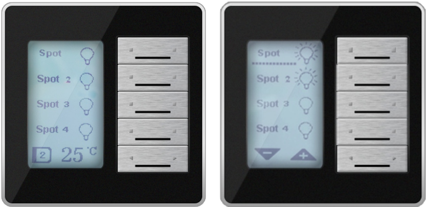
Lighting Control Long Press to dim the Lighting