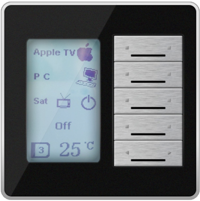
Customize Page & Scene Recording