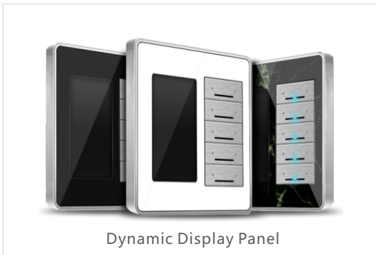
Dynamic Display Panel